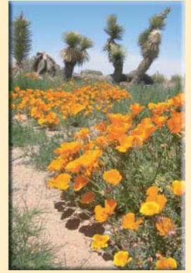
Joshua Tree National Park

Costs: see detailed costs on insert in catalog