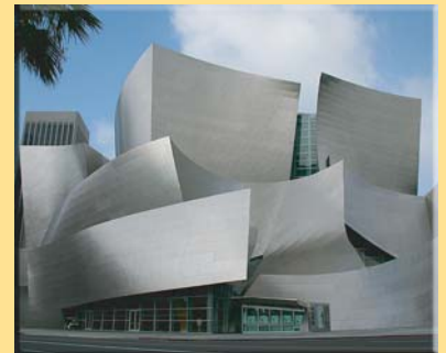
Walt Disney Concert Hall, L. A.