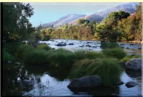
Kern River Valley

When you've seen enough desert and have had your fill of sand dunes, canyons, and Joshua trees you can rejuvenate in the lovely Kern Valley where winter is just beginning to slip away and it is still early spring. This higher elevation offers you a serene setting. Stand surrounded by mountains, stroll along the river or spend your time shopping in the small and friendly downtown area. Every spring is unique and activities will be adjusted according to the weather and wildflower bloom.