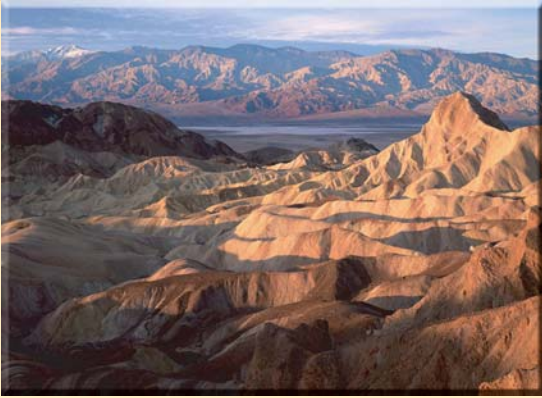
Sunrise at Death Valley National Park, California