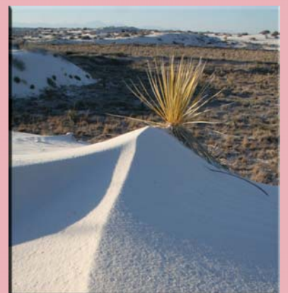
White Sands National Monument

visit www.traveldreamwest.com for detailed information