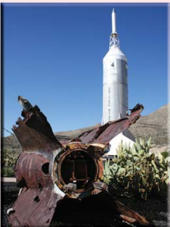
Space Hall Rockets

Stroll through art galleries, museums and old missions as you explore Tucson, Santa Fe, Sedona and Flagstaff. Revel in the unique atmosphere of Ajo, a tiny town in the midst of the desert, spend the night in a Route 66 wigwam, and relax in a hotel with lake view, far removed from the bustle of everyday life.