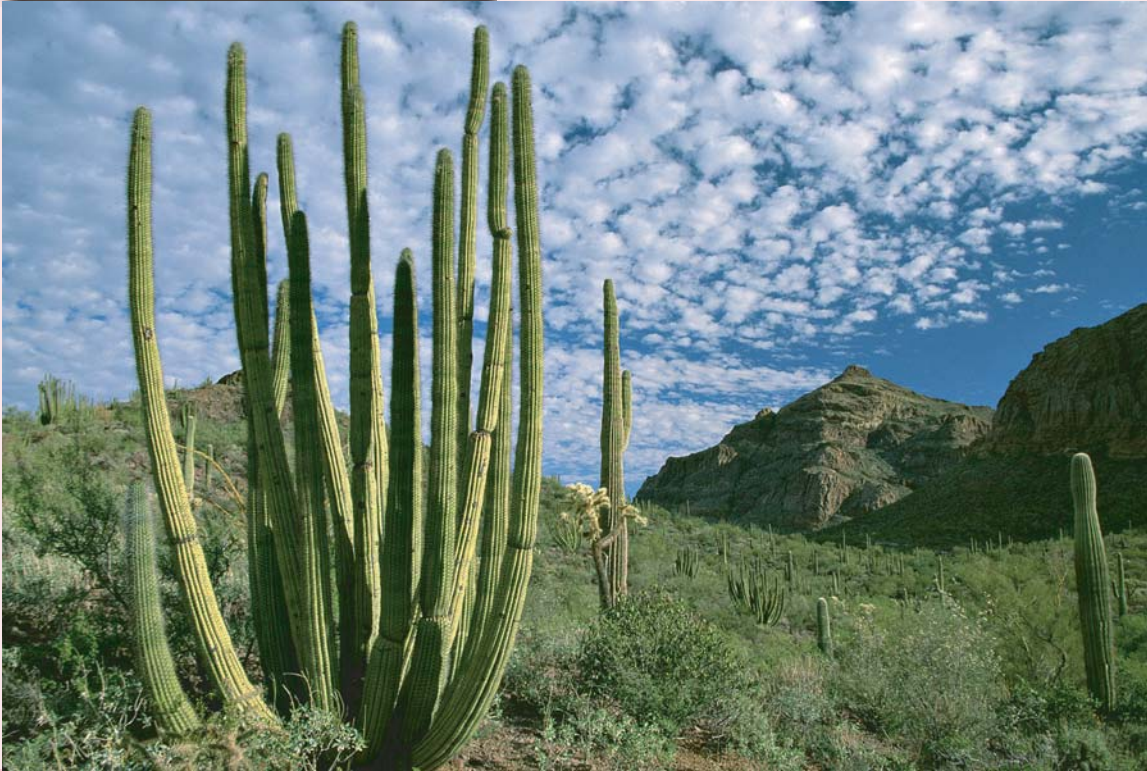
Organ Pipe Cactus ( Stenocereus Thurberi ) and Diablo Mountains. Organ Pipe National Monument, Arizona

From magnificent natural scenery to cultural history and fine South-western cuisine this guided tour takes you beyond the usual sights.