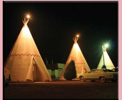
Wigwam Motel, Route 66

From the well known wonders of the Grand Canyon, Sedona's rock formations and giant logs of the Petrified Forest to little visited attractions like the Chiricahua and Tent Rock formations, White Sands National Monument and more this tour combines the famous with the rare and unusual. Hike and drive through vastly colorful "painted" hills, relax at a river surrounded by forests, then hike through volcanic history.