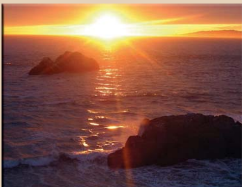
Sunset over the Ocean