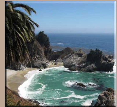
Big Sur, California Coast

Let us introduce you to the greatest, the most beautiful, and the little known. Outdoor wonders abound in these grand regions and there's no lack of natural beauty anywhere along this route. Explore the desert regions of Utah as you hike and relax in Arches, Canyonlands, Capitol Reef and Zion National Parks. Complete with a variety of unique geologic features including the famous bridges and arches. This is an area that offers beauty from the subtle to the grand. Witness history as you tour Monument Valley, home of the Navajo and famous for its movies. Delve even further back as you explore the ancient cliff dwellings of Mesa Verde. Enjoy a ride on the Durange railway and discover the history of the pioneers that settled this area. Of course a trip to the West wouldn't be complete without a stop at the Grand Canyon. And from there the journey continues on through the hot Death Valley to the lush greenery of Yosemite National Park.