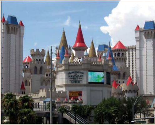
Las Vegas Downtown

19 Days / 18 Nights from Las Vegas, NV to San Francisco, CA