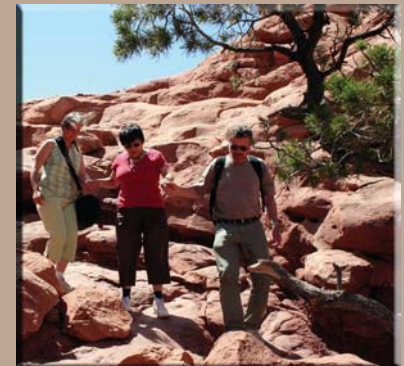
Hiking in Arches National Park