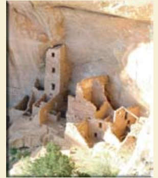
Mesa Verde National Park

Costs: see detailed costs on insert in catalog