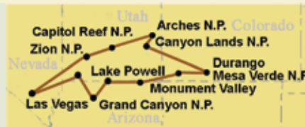
Grand Circle States-Tour Route Map

Meet your tour group in this exciting, lively city and spend your first evening on the strip. Complete with fascinating architecture, entertainment and a unique culture distinctly different from anywhere else in the world this is one city that truly never sleeps. From this human created metropolitan paradise we will venture on into the natural landscapes of the West.