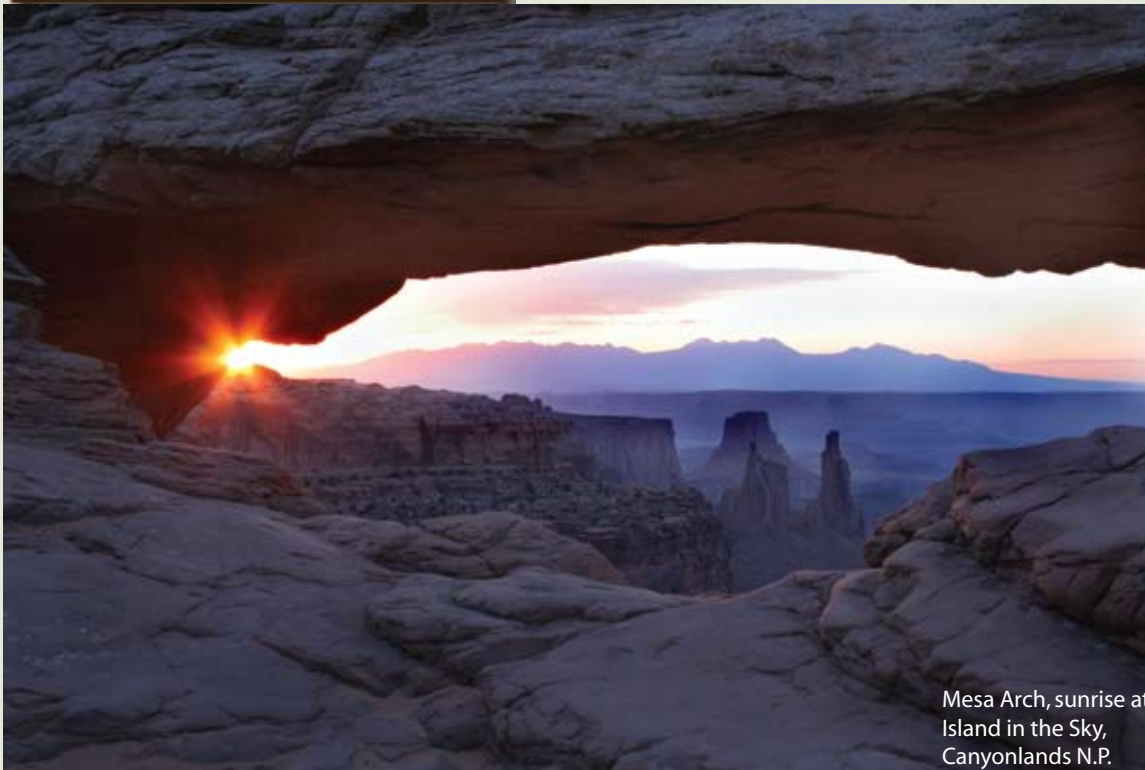
Mesa Arch, sunrise at Island in the Sky, Canyonlands N.P.

This tour of Utah, Arizona, Colorado, Wyoming and Nevada combines all the greatest highlights of the Grand Circle area with less known natural wonders off the beaten path.