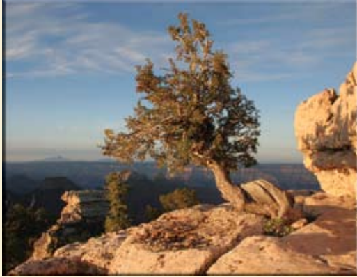
Grand Canyon Sunrise