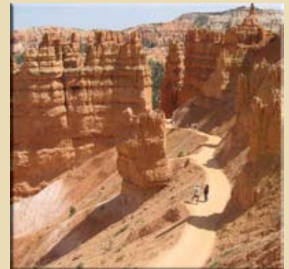
Bryce Canyon Hike

This outdoor adventure offers you a glimpse into the fascinating geologic history of the Colorado Plateau. Stand dwarfed by giant rock arches, look down on massive carved river valleys including the famous Grand Canyon, and gaze over endless expanses of rocky, harsh beauty. Hike into the heart of Bryce Canyon with its colorful formations, or take a peaceful rim walk for stunning views into the canyon. Choose to take a boat ride on brilliant Lake Powell or travel down the Colorado River by night, or just relax in your comfortable cabins with a good book. Visit slot canyons and giant rock formations formed by thousands of years of interacting elements. And while you explore the many National Parks and Monuments featured on this tour, keep an eye out for wildlife and interesting plants.