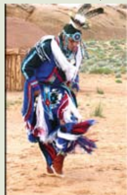
Navajo Heritage Center, Page AZ