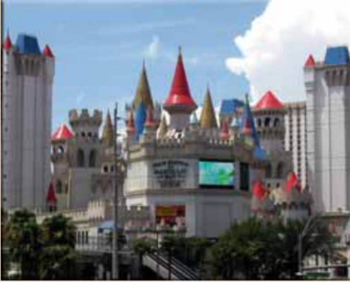
Las Vegas Hotel Excalibur