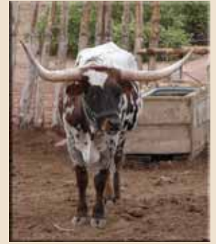
Pioneer Style Oxen