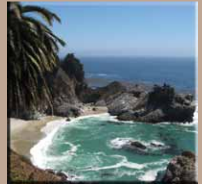
Big Sur, California Coast

Let us introduce you to the greatest, the most beautiful, and the little known. Outdoor wonders abound in these grand regions and there's no lack of natural beauty anywhere along this route. Explore the desert regions of Utah as you hike and relax in Arches, Canyonlands, Capitol Reef and Zion National Parks. Complete with a variety of unique geologic features including the famous bridges and arches. This is an area that offers beauty from the subtle to the grand. Witness history as you tour Monument Valley, home of the Navajo and famous for its movies. Delve even further back as you explore the ancient cliff dwellings of Mesa Verde. Enjoy a ride on the Durango railway and discover the history of the pioneers that settled this area. A trip to the West isn't complete without Grand Canyon and a journey through hot Death Valley to the lush greenery of Yosemite National Park.