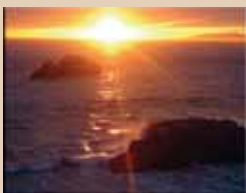
Sunset over the Pacific Ocean