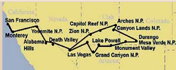
Western Wonderland Tour Route Map (Utah, Colorado, Arizona, Nevada and California)

From the heart of the West to the rolling waves of the Pacific Ocean this tour takes you beyond the everyday for an adventure you'll never forget.