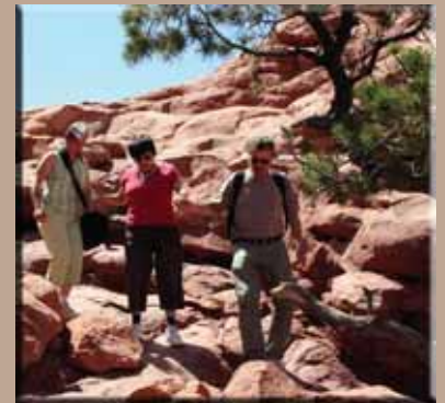
Hiking in Arches National Park